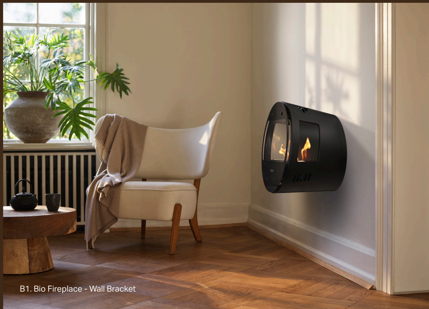
B1. Bio Fireplace - Wall Bracket