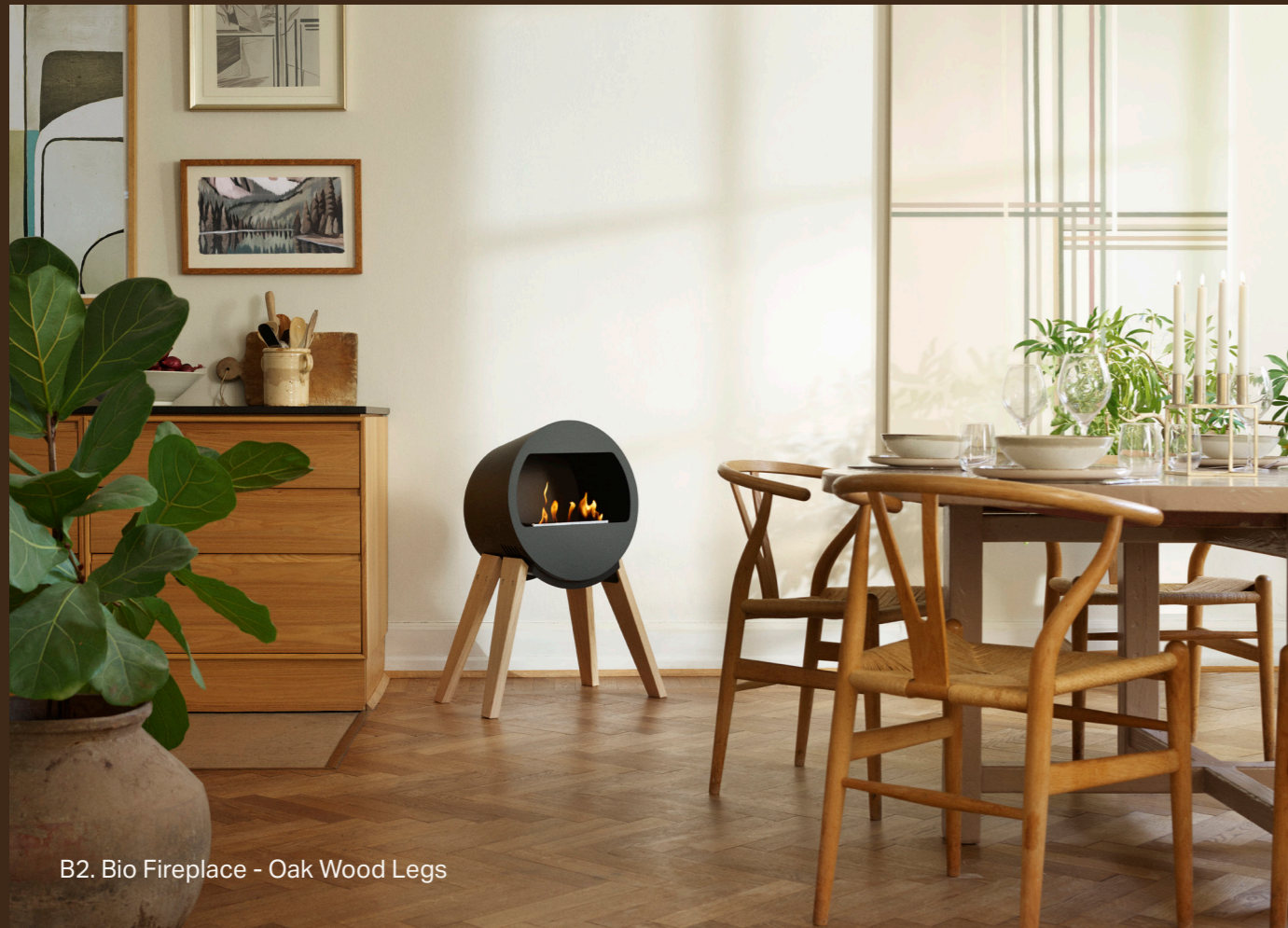
B2. Bio Fireplace - Oak Wood Legs