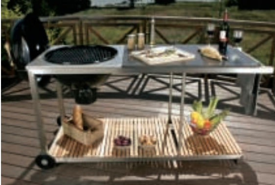
Long module with charcoal grill