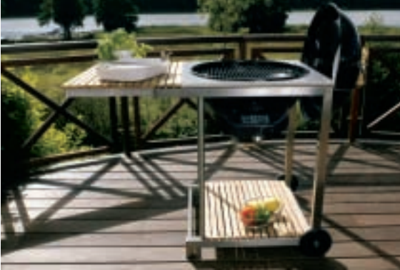
Short module with additional plate and gas grill

“When choosing an Aduro outdoor kitchen you will get a carefully prepared and flexible product with many possibilities to combine.”