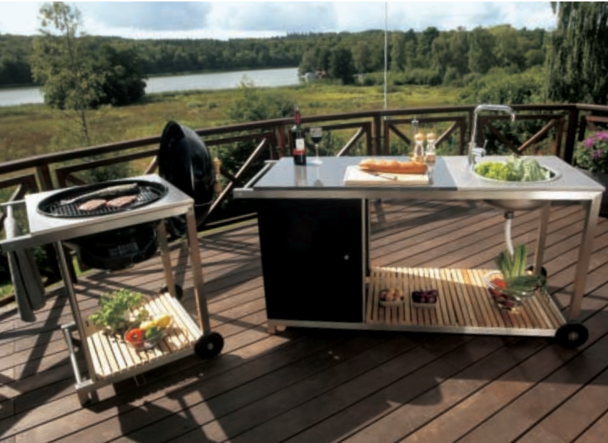
Short module with a gas grill and a long module with sink and cupboard.